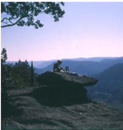
Indian Fort Theater

Get back on 21 west and head past downtown Berea. When you are back on Chestnut Street, look to your left for Participant 51, The Doctor's Inn of Berea Bed and Breakfast . This B&B and elegant house will pamper you from morning to night. Within walking distance to Old Town