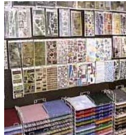
Scrapbooks on Broadway