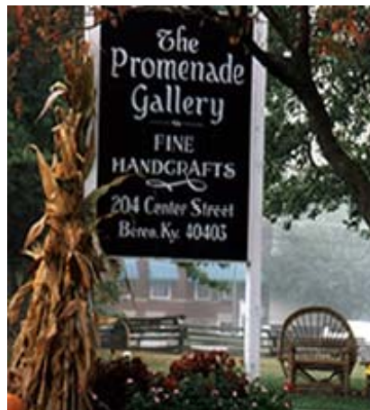
The Promenade Gallery

Walk towards Center Street to the right. You will discover Participant 39, The Promenade Gallery . Here you can unearth a fine collection of contemporary crafts from both KY artisans and others around the United States. The Promenade Gallery features an exceptional collection of fiber art, musical instruments, garden art, paintings, pottery, jewelry, kaleidoscopes, furniture, sculpture, baskets, wood turning, whimsical art and more . The side street running perpendicular to Center